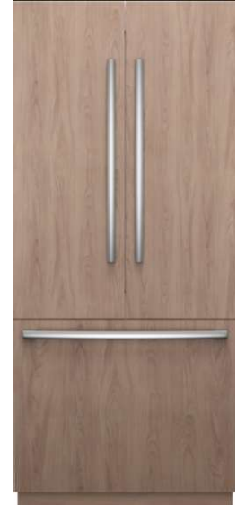
B36IT100NP 36" Built-In French Door Bottom Freezer Panel Ready