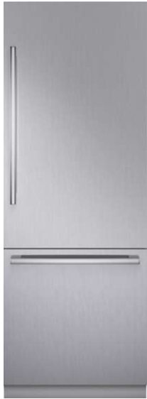
B30BB130SS 30" Built-In Single Door Bottom Freezer Stainless Steel