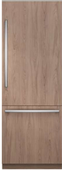
B30IB100SP 30" Built-In Single Door Bottom Freezer Panel Ready