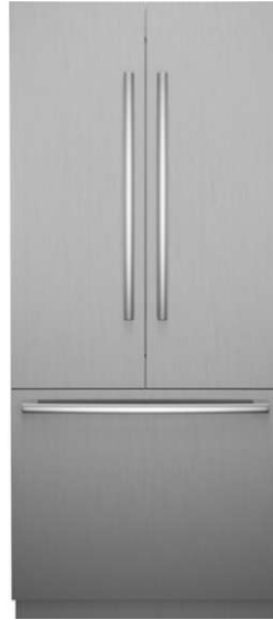
B36BT130NS 36" Built-In French Door Bottom Freezer Stainless Steel