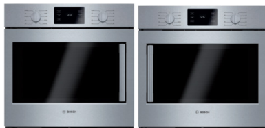
Left or Right Side Open