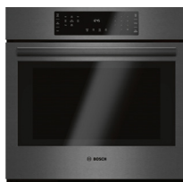
Black Stainless Steel *without Air Fry