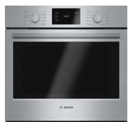
30" Thermal Only HBL5351UC