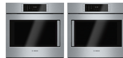
Left or Right Side Open *without Air Fry