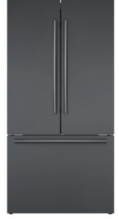
3 Door Black Stainless Steel Bar Handle B36CT80SNB