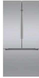
3 Door Stainless Steel Recessed Handle B36CT81ENS