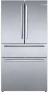
4 Door Stainless Steel Bar Handle B36CL80SNS