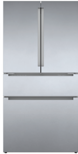
4 Door Stainless Steel Recessed Handle B36CL80ENS