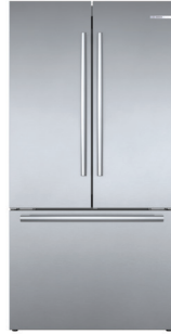
3 Door Stainless Steel Bar Handle B36CT80SNS