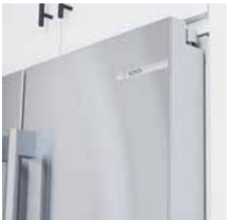
Classic stainless steel.

Sleek and easy to clean, classic stainless steel offers a timeless design that will effortlessly match other appliances in your kitchen.