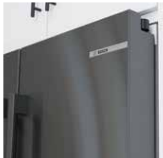
Black stainless steel.

Sleek and easy to clean, classic stainless steel offers a timeless design that will effortlessly match other appliances in your kitchen.