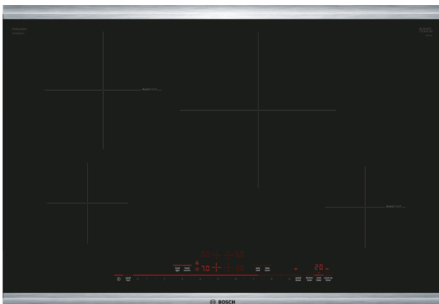
NIT8060SUC* - 30"