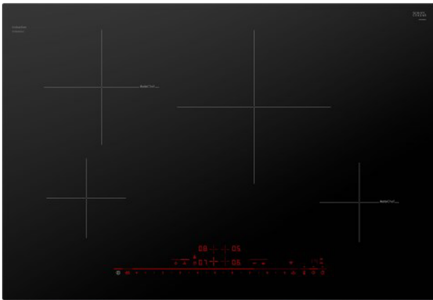
NIT8060UC - 30"