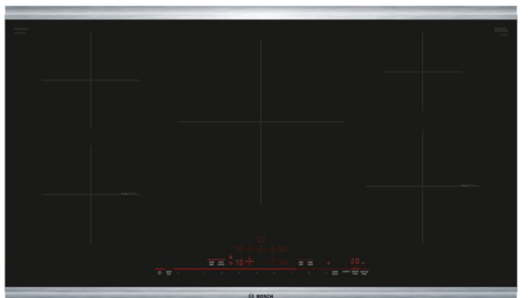
NIT8660SUC* - 36"