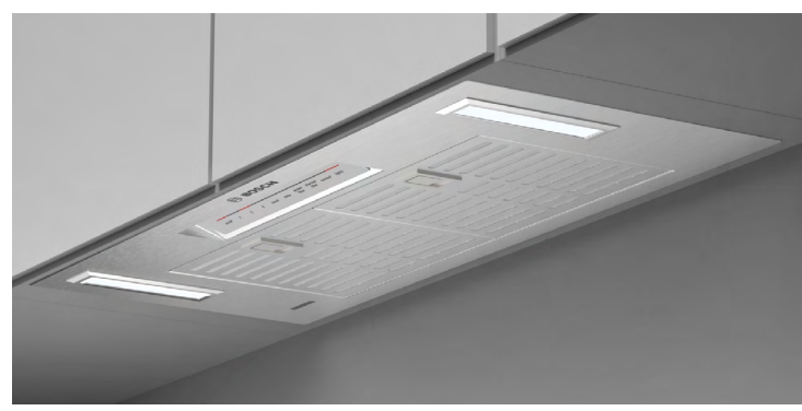
Installed in frameless cabinets

Accessories: To purchase Bosch accessories, cleaners & parts please visit www.bosch-home.com/us/store or call 1-800-944-2904 (Mon to Fri 5 am to 6 pm PST, Sat 6 am to 3 pm PST). Notes: All height, width and depth dimensions are shown in inches. BSH reserves the absolute and unrestricted right to change product materials and specifications, at any time, without notice. Consult the product's installation instructions for final dimensional data and other details prior to making cutout. Warranties: Please see Use & Care manual or Bosch website for statement of limited warranty.