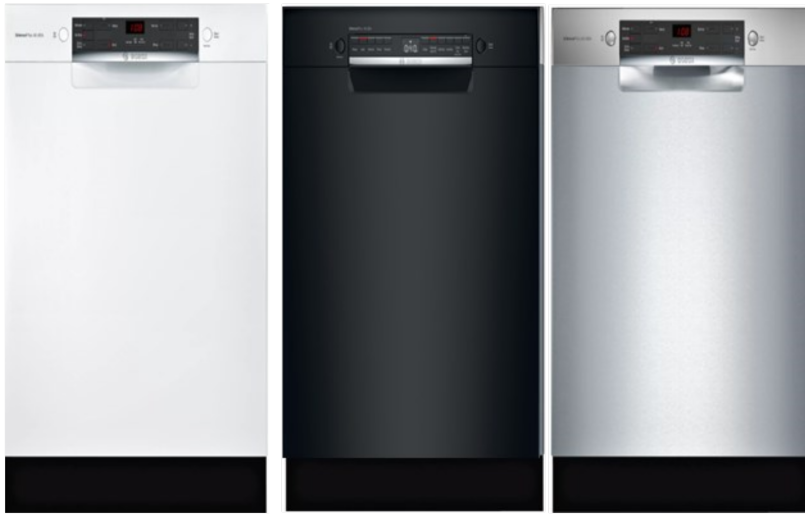
SPE53B52UC SPE53B56UC SPE53B55UC