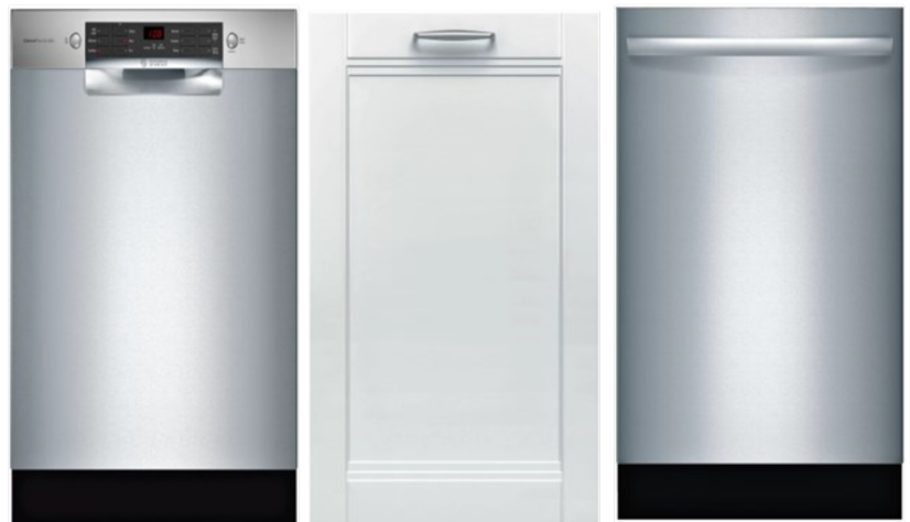
SPE68B55UC SPV68B53UC SPX68B55UC