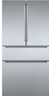
4 Door Stainless Steel Recessed Handle B36CL80ENS