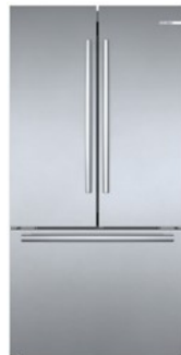
3 Door Stainless Steel Bar Handle B36CT80SNS