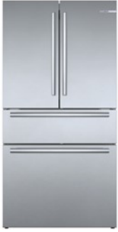
4 Door Stainless Steel Bar Handle B36CL80SNS

Revolutionary Bosch counter-depth refrigerators, with streamlined interior and an advanced freshness system that keeps the ingredients you love fresher longer. Enjoy less food waste, and more thoughtful design.