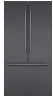
3 Door Black Stainless Steel Bar Handle B36CT80SNB