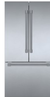
3 Door Stainless Steel PRO Handle B36CT81SNS