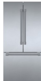
3 Door Stainless Steel PRO Handle B36CT81SNS