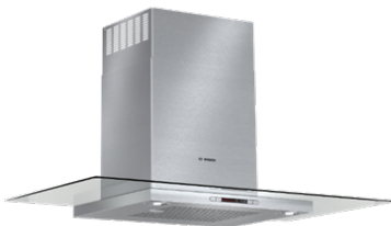
HCG56651UC 36" Chimney Hood 600 CFM