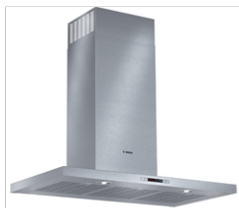
HCB56651UC 36" Chimney Hood 600 CFM

The dual flame ring power burner allows for better heat distribution and more uniform cooking. One burner takes you from a high power dual flame for boiling or searing to one small flame for precise simmering.