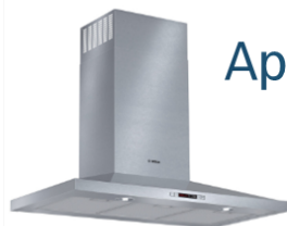
HCP36651UC 36" Chimney Hood 600 CFM