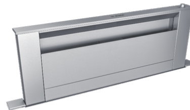
HDD86051UC 36" Downdraft paired with 36" Rangetop