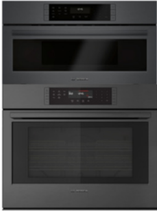
Combo Oven w/Speed HBL8742UC