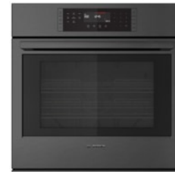
Wall Oven HBL8442UC