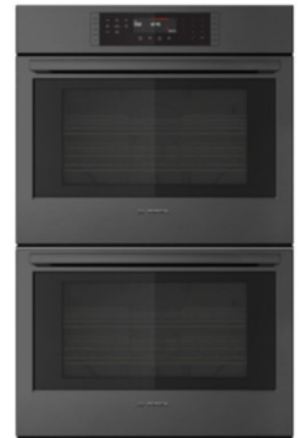
Double Oven HBL8642UC