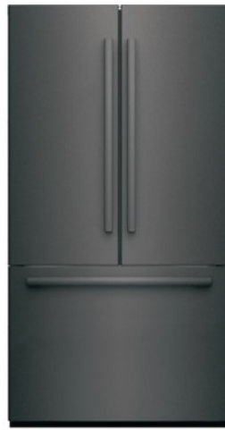
French Door Bottom Mount Counter Depth B21CT80SNB