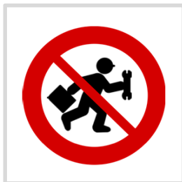
Lowest Repair Rate**