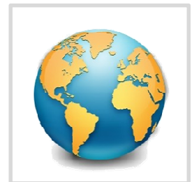
#1 Dish Brand Globally***