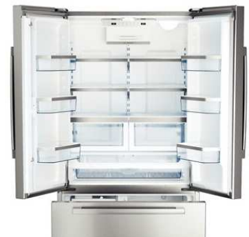
Counter-Depth French Door B22CT80SNS (8446022)

Save Your Customer up to $680 on this Bosch Kitchen Package! Offer good, Now thru April 25 th , 2015