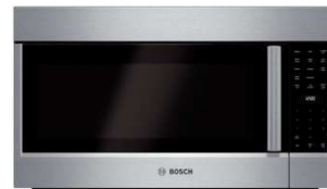
Over The Range Microwave HMV8052U (5771164)