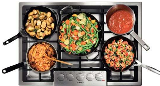
Gas NGM8055UC (5628045)