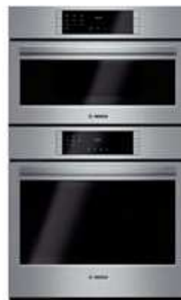
Combination Oven HBL8751UC (5906148)