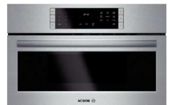
Speed Microwave Oven HMC80151UC (5969086)