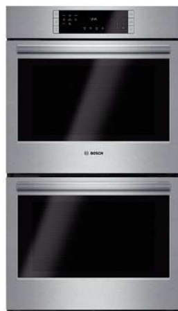
Double Oven HBL8651UC (5906033)