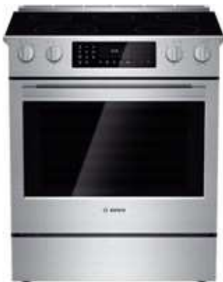
Electric HEI8054U (5906097)

Love a sleek, built-in look but only have room for a range? Replace your freestanding range to a slide-in range without changing cabinetry or countertops. These sleek, full-depth ranges optimize counter space, offering five burners, ovens with European convection and a convenient warming drawer.