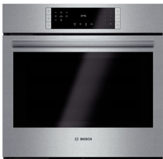
Single Oven HBL5451UC (5906042)

Bosch wall ovens offer optimum design flexibility while balancing form and function. Bosch wall ovens look great installed together or separately, and can be installed horizontally for perfect design alignment next to another oven, or in a vertical stacked configuration.