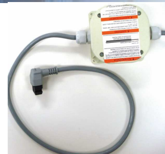
Factory Provided: Junction Box - Hardwire Applications