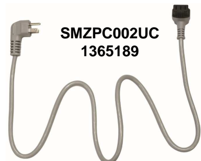
Accessory not included: 3-Prong Cord – Direct Plug-in Applications