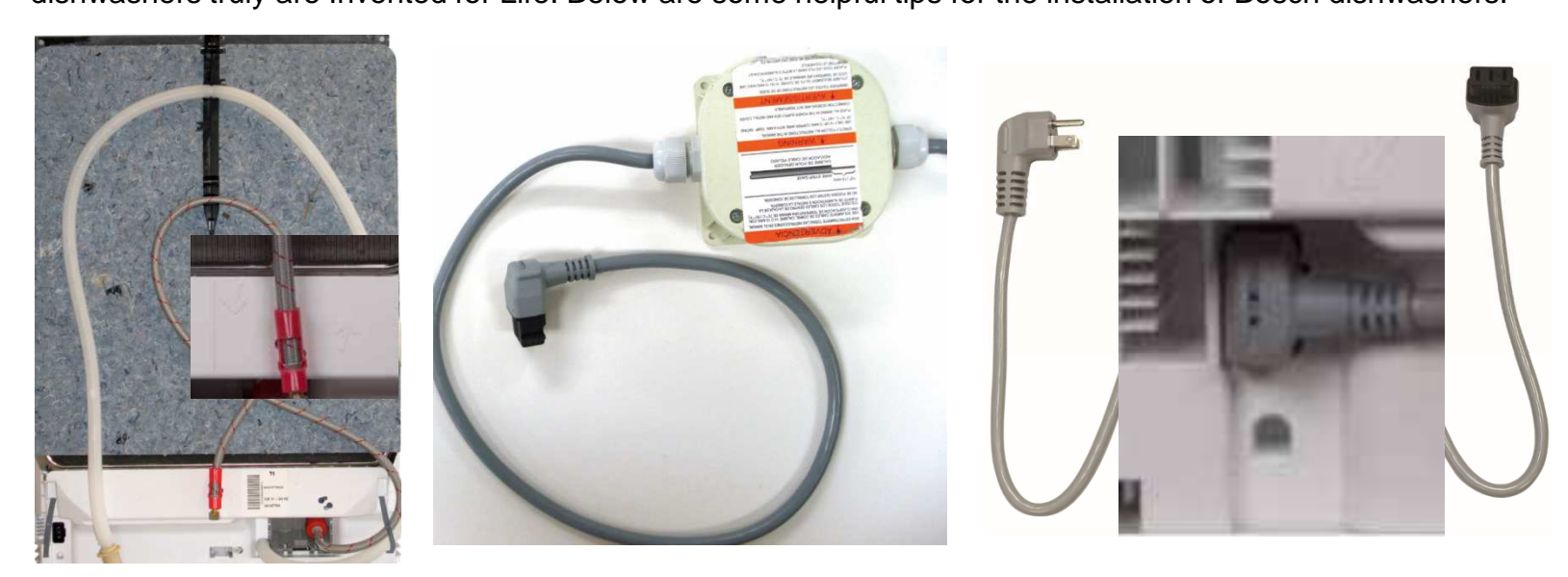
Factory Installed: 3/8" Braided Water Supply Line Did you know?

The new Bosch dishwasher line is full of new features. From our new 3rd rack to our deeper tub and 24/7 AquaStop® leak protection, over 100 engineers designed our new line-up of dishwashers to fit your customer's lifestyle. In addition, every full stainless steel tub dishwasher is now easier to install than ever before. Bosch dishwashers truly are Invented for Life. Below are some helpful tips for the installation of Bosch dishwashers.