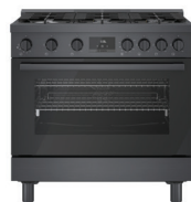
HGS8645UC 36" 6-Burner Black Stainless Steel