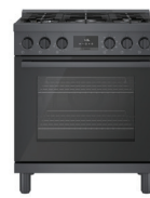
HDS8045U 30" 5-Burner Black Stainless Steel