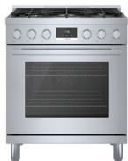
HGS8055UC 30" 5-Burner Stainless Steel