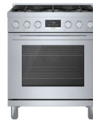
HDS8055U 30" 5-Burner Stainless Steel