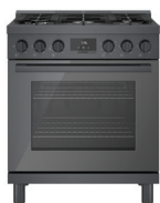
HGS8045UC 30" 5-Burner Black Stainless Steel