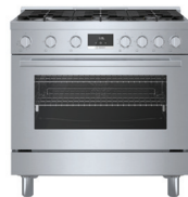
HGS8655UC 36" 6-Burner Stainless Steel