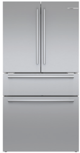
B36CL80SNS Stainless Steel Counter-Depth