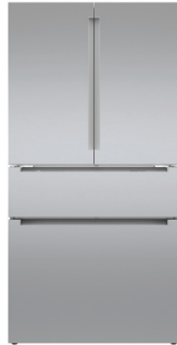
B36CL80ENS Stainless Steel Counter-Depth