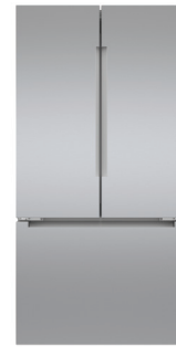
B36CT81ENS Stainless Steel Counter-Depth