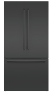
B36CT80SNB Black Stainless Steel Counter-Depth