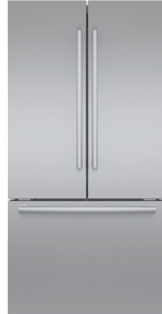
B36CT80SNS Stainless Steel Counter-Depth