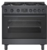
HGS8645UC 36" 6-Burner Black Stainless Steel