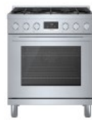
HDS8055U 30" 5-Burner Stainless Steel