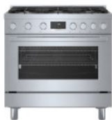
HGS8655UC 36" 6-Burner Stainless Steel