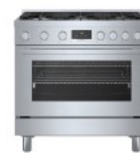
HDS8655U 36" 6-Burner Stainless Steel