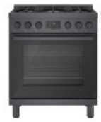
HDS8045U 30" 5-Burner Black Stainless Steel