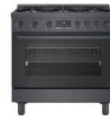
HDS8645U 36" 6-Burner Black Stainless Steel