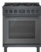
HGS8045UC 30" 5-Burner Black Stainless Steel