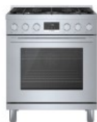
HGS8055UC 30" 5-Burner Stainless Steel