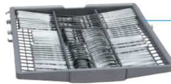
Standard 3rd rack

Provides the perfect space for flatware, large utensils, measuring cups, or nearly anything else that's difficult to fit in a traditional dishwasher, while its V shape leaves room below both sides for taller items like stemware in the middle rack. Available on all 300 Series models.