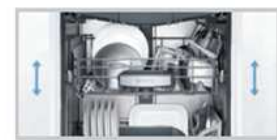
RackMatic® adjustable rack

This convenient new feature lets you fold back every other tine in one simple step, so it's easier to fit your largest, bulkiest items. Available on lower racks in 300 Series models and up, it helps to hold pots and pans upright, leaving more room for your other dishes.