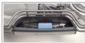
Rack-mounted detergent tray

For a level of quality you can both touch and feel, we've incorporated smooth-rolling ball bearings to our rack wheels. The result is a smoother glide that opens effortlessly—even with a fully loaded rack—for a more premium feel with every pull.