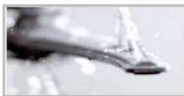
Sensor wash system

Optimized for tablets, our detergent tray holds tabs in place for a dedicated spray jet to directly dissolve them completely. This not only results in a deeper clean, it also helps to reduce unwanted noise since there's no water jet spraying the inner door. (Dishwasher also works with powder and gel.)