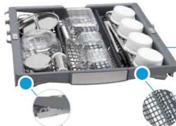
Flexible 3rd rack

Provides the perfect space for flatware, large utensils, measuring cups, or nearly anything else that's difficult to fit in a traditional dishwasher, while its V shape leaves room below both sides for taller items like stemware in the middle rack. Available on all 300 Series models.