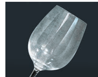
Hard water deposits

Hard water is tough on dishes—and your dishwasher. If you live in a hard water area, glasses may come out looking cloudy or spotted, and your dishes may not get as clean as they should. That's why select 300 Series and ADA dishwashers offer a built-in water softener, which removes hard water spots caused by lime deposits and softens the water to appropriate levels for spot-free, shiny dishes.