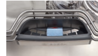
Rack-mounted detergent tray

Optimized for tablets, our detergent tray holds tabs in place for a dedicated spray jet to directly dissolve them completely. This not only results in a deeper clean, it also helps to reduce unwanted noise since there's no water jet spraying the inner door. (Dishwasher also works with powder and gel.)