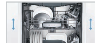
RackMatic® adjustable rack

MyWay™ offers more room for more kinds of items in the top rack, such as cereal bowls, whisks, tongs and large measuring cups, creating more freedom in loading below. Available on all 800 Series Premium models.