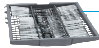
Standard 3rd rack

Frees up space below for larger items like stock pots.