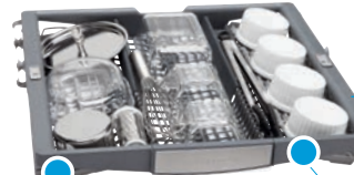
Flexible 3rd rack

Provides the perfect space for flatware, large utensils, measuring cups, or nearly anything else that's difficult to fit in a traditional dishwasher, while its V shape leaves room below both sides for taller items like stemware in the middle rack. Available on all 300 Series models.