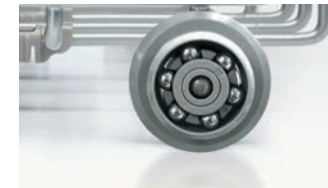
EasyGlide™ rack system

This state-of-the-art system uses an advanced scanning-eye sensor to literally look at the level of soil in the wash water, and adjusts both the water temperature and length of the wash cycle to eliminate redeposits. It can also determine if a secondary, fresh water fill is necessary, deleting the cycle whenever appropriate to save water and energy.