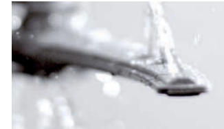
Sensor wash system

Optimized for tablets, our detergent tray holds tabs in place for a dedicated spray jet to directly dissolve them completely. This not only results in a deeper clean, it also helps to reduce unwanted noise since there's no water jet spraying the inner door. (Dishwasher also works with powder and gel.)