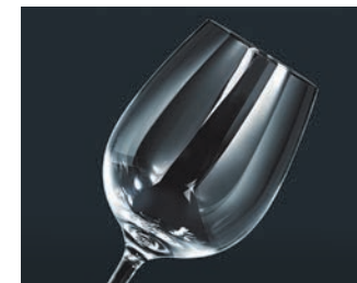
After softening the water