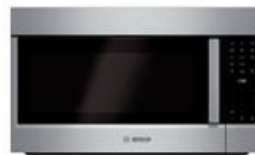
HMV8053U (5509900) (New)