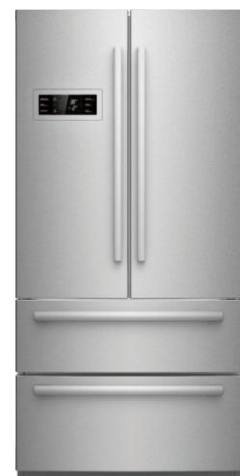
B21CL80SNS (5546303) (New)