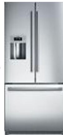
B26FT80SNS (4996500) (New)