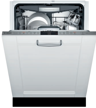
SHVM78W53N Custom Panel

The flexible 3rd rack allows you to accommodate deeper items, while adjustable tines let you customize the rack's loading space.