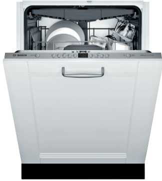
SHVM63W53N Custom Panel

The 3rd rack provides the perfect space for silverware and large utensils while its V shape leaves room below for taller items.