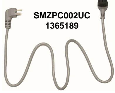
Accessory not included: 3-Prong Cord – Direct Plug-in Applications