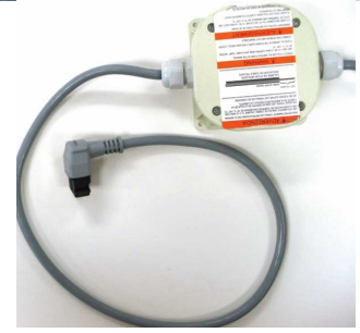
Factory Provided: Junction Box - Hardwire Applications